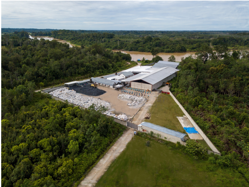
Mandiri Mineral Separation Plant