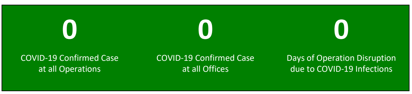
Exhibit I-2: COVID-19 Status at PYX

COVID-19 pandemic has become a crisis for many mining companies. However, it is not the case for PYX because the Company has responded quickly by taking great care of its staff, contractors, and the communities it works with to assure preventive measures are put in place.