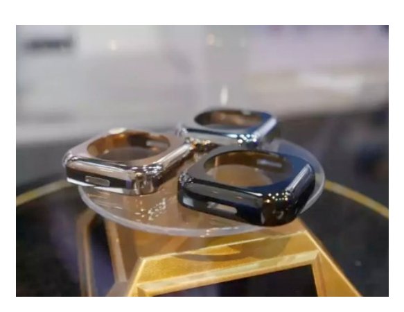
High-end watch cases